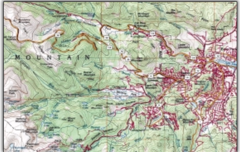
Above: TOPO! 100k topographic map with GDT road data

referenced to either latitude/longitude or UTM map projections, in either the Nad83/WGS84 or NAD27 map datum.